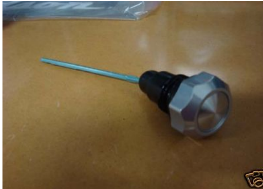
OEM 62693-07 FL, OEM 62853-06 FXD